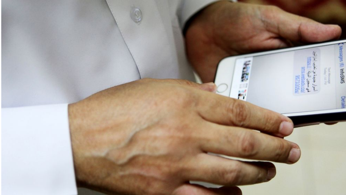
Human rights activist Ahmed Mansoor shows Associated Press journalists a screenshot of a spoof text message he received in Ajman, United Arab Emirates, on Thursday, Aug. 25, 2016. The text message reads: "New secrets on the torture of Emirati citizens in jail."

In August 2016, in the most publicized government attempt to hack his iPhone cell phone and online accounts, Mansoor received a text containing a link that the sender promised would divulge information on detainee torture in UAE prisons. 13 Instead of clicking on the link, Mansoor forwarded the message to Citizen Lab researchers who determined that this was a sophisticated phishing attempt using technology from an Israeli company, the NSO Group. 14 The attack exposed vulnerabilities in Apple's mobile operating system, spurring the company to release an update fixing that security flaw. Security experts said at the time that the tool used to target Mansoor could be worth as much as $US 1 million, leading some to refer to Mansoor with his newly-acquired notoriety as "the million-dollar dissident." 15